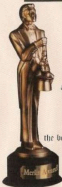
The Merlin Award is a Fair Share of I.M.S.

As a lifetime member of the International Magicians Society, a fraternity of magicians dedicated to preserving and promoting the art of magic.